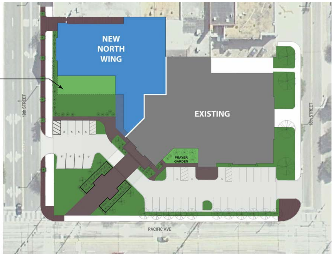
SITE PLAN 1/8" = 1'-0"

POSSIBLE LOCATION FOR 1,650 S.F. PLAYGROUND APPROXIMATELY 72'x23'